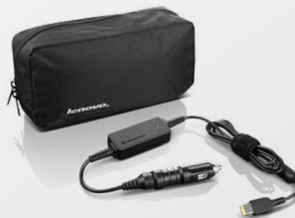
Lenovo® 65W DC Travel Adapter