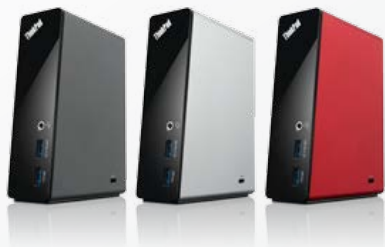
ThinkPad® OneLink Dock