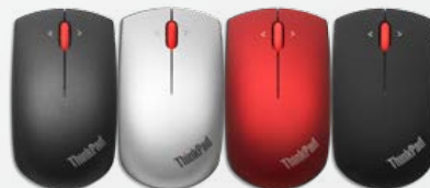
ThinkPad Wireless Precision Mouse