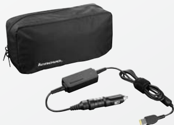
Lenovo® 65W DC Travel Adapter