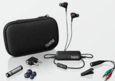
ThinkPad Noise-Cancelling Ear buds