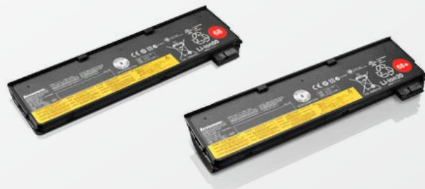
ThinkPad 68/68+ Battery