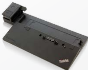
2013 ThinkPad® Docking: ThinkPad Ultra Dock, ThinkPad Pro Dock and ThinkPad Basic Dock