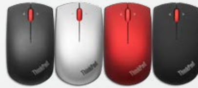
ThinkPad® Precision Wireless Mouse