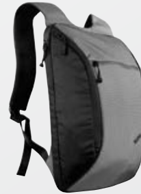
ThinkPad® Ultralight Backpack