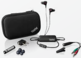
ThinkPad® Noise-Cancelling Earbuds