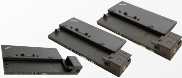
New ThinkPad® Docking (Basic, Pro, and Ultra)