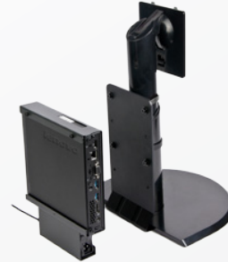
ThinkCentre® Tiny L-Bracket Mounting Kit (0B47096)