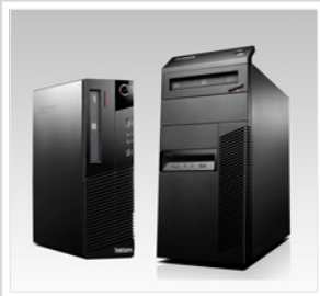
Small Form Factor Pro Expandability and functionality of a mini-Tower at just 50% of the size