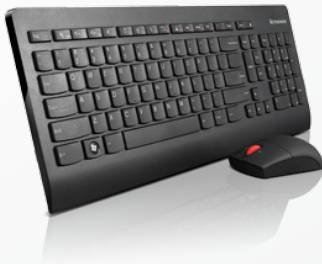
Lenovo® Ultralim Wireless Keyboard and Mouse Combo (0A34032)