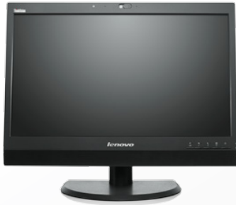
ThinkVision® LT2323z Monitor