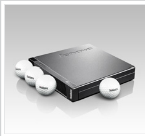
Tiny Form Factor Tiny is as compact as golf ball