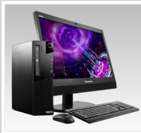
Graphic Experience life-like video quality with discrete graphics up to NVIDIA® Quadro® 410 4