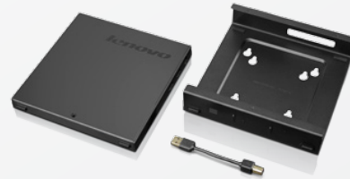
ThinkCentre® Tiny Storage Unit (0A65637)