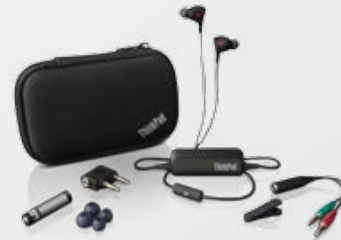
ThinkPad Noise-Cancelling Earbuds