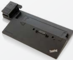
New ThinkPad docking for security, connection, and power