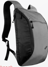
ThinkPad® Ultralight Backpack