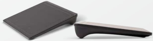
Lenovo® Wireless TouchPad